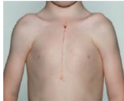
This shows the scar after a major heart operation.

After a major heart operation many patients are left with a large scar. This scar can cause a great amount of pain for the patient, which further prolongs the 6-8 week recovery time. With the use of the da Vinci system the scar can be reduced many times over, making the scar and recovery time the same as a minimal invasive procedure.