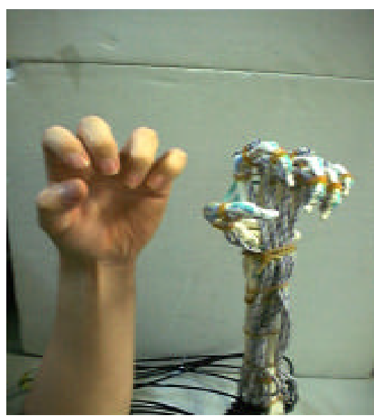
Robotic arm created from EAP

Today artificial muscles can be applied in many areas of science, medicine, entertainment etc.