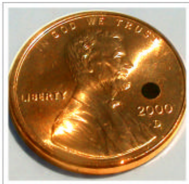
2mm ASR® device lying on a penny

Basically the implant consists of an array of tiny solar cells (photodiode) thinner than a human hair with a diameter of just 2 mm. These are capable of converting light into electric current. And a small micro-electrode located on each micro-photodiode to transfer the current to the adjacent tissue.